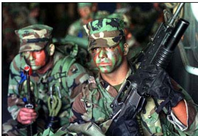
Croatia is taking necessary measures to achieve its major foreign policy goal, NATO accession, placing the country under the umbrella of collective security.

WASHINGTON, D.C., Nov. 16 – The Committee on International Relations of the U.S. Congress House of Representatives unanimously adopted a resolution recommending that Croatia be admitted into NATO as soon as possible in acknowledgment of the progress the country had made in meeting the membership criteria and significantly improving its cooperation with the Hague War Crimes Tribunal. The resolution was moved in early November by Congressman Elton Gallegly of California, who chairs the Subcommittee on Europe of the Committee on International Relations. The resolution was co-sponsored by congressmen George Radanovich and Peter Visclosky, who co-chaired the Congressional Croatian Caucus.