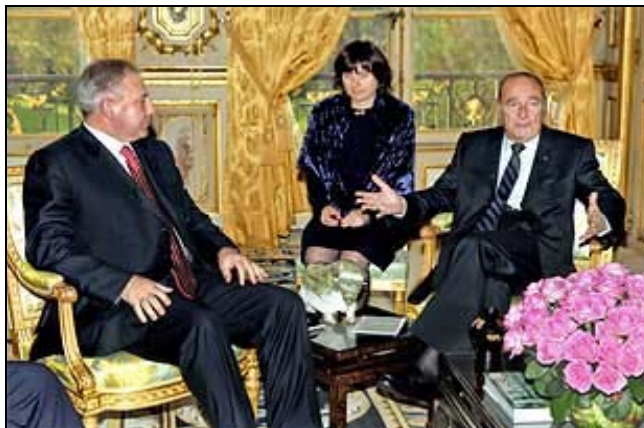
Croatian Prime Minister Ivo Sanader (left) with French President Jacques Chirac (right). During his visit to France, Prime Minister Sanader expressed satisfaction with the talks and acknowledged “great progress” in bilateral relations.