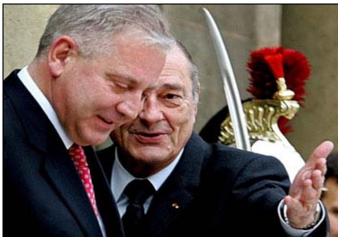
Prime Minister Sanader confirmed with French President Chirac the strengthening of political, economic and cultural relations between Croatia and France. (Page 2)