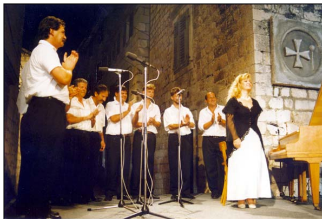
Klapa Sinj, performing with Meri Cetinić, one of the greatest voices of Croatian pop music.

Klapa Sinj will perform for the first time in the United States this year, with appearances slated for the World Music Institute in New York City on December 2 nd , [ www.nysec.org ], [ www.worldmusicinstitute.org ], Washington DC's Kennedy Center on December 4 th , [ www.kennedycenter.com ] and the Chicago Cultural Center's Preston Bradley Hall on December 7 th . [ www.cityofchicago.org/CulturalAffairs ]. Additional performances are planned for major universities.