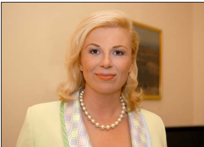
Foreign Minister Kolinda Grabar-Kitarović was commended by the EU for her work in achieving Croatia's progress.

BRUSSELS, Belgium, Nov. 15 – The European Union highly values the excellent cooperation between the OSCE Mission in Croatia and the host country. The OSCE Mission in Croatia serves as a model of effective support along the path to democratic conditions, said a statement published on the web site of the UK Presidency.