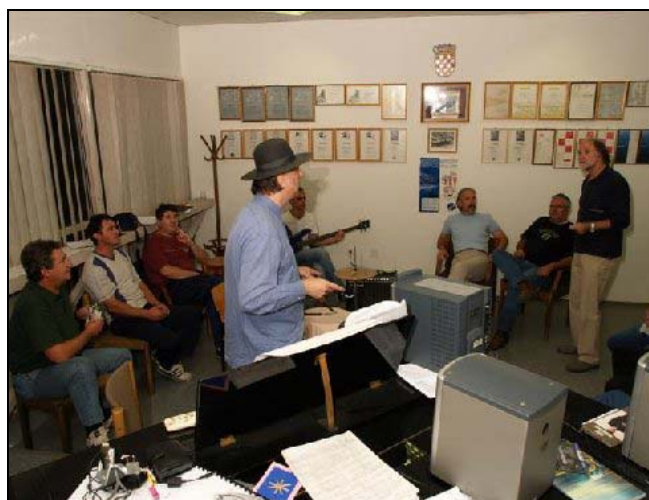
Klapa Sinj, during one of their rehearsals in September, 2005, in preparation for their upcoming U.S. tour.