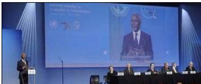
UN Secretary General Kofi Annan speaks at the Summit on Information Society in Tunisia.

TUNISIA, Tunis, Nov. 16 – Croatian President Stjepan Mesić participated in the UN Summit on Information Society in Tunisia. “Information is becoming the foundation of the authority, position and influence, the foundation of a threat to our civilization, but also the foundation of its defense. Information, namely its malignant from misinformation, is becoming a powerful weapon in the fight against political opponents, economic competition, but not against those of same views,” Mesić said. According to Mesić, every country has the right and obligation to defend itself and its citizens from global terrorism. A three-day summit on information society is the second phase of a summit held in Geneva two years ago. It pooled 50 Heads of State and prime ministers and more than 11,000 officials, and business managers from wealthy and poor countries so as to put in motion a UN initiative aimed at increasing access to modern telecommunications and the Internet in developing countries. The summit was also addressed by UN Secretary General Kofi Annan.